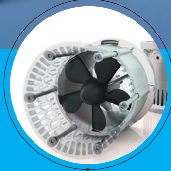
No vacuum, no need priming. Pushing the water up with the propeller.