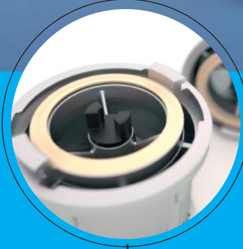
Kube Pump has unique protection system to prevent damage to the pump and the engine