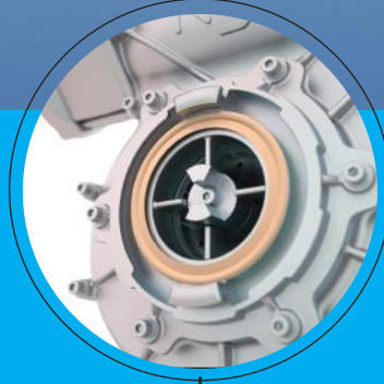
Working dry won't give any damage to pump or engine.